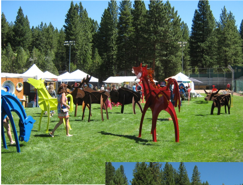
2014 Incline Village Art Festival at Preston Field